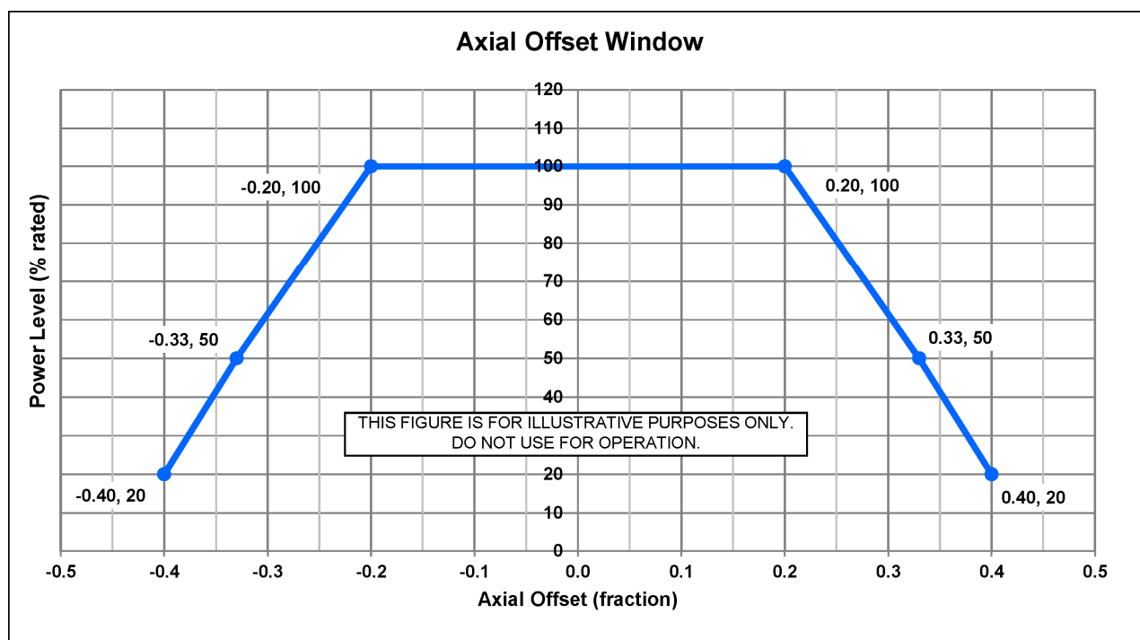
Figure B 3.2.2-1 (page 1 of 1) Axial Offset Window