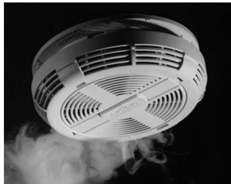
Ionization chamber smoke detector

Smoke detectors have saved thousands of lives since they came into use in the 1960s. Ionization chamber smoke detectors, the most common type, use radiation to detect smoke. The NRC allows this “beneficial use” of radioactive material because a smoke detector’s ability to save lives far outweighs any health risk from the radiation. These products use very small amounts of radioactive materials. They are so safe homeowners can use them without an NRC license. Manufacturers and distributors do need an NRC license. To receive one, they must show their products meet the NRC’s health and safety requirements and are properly labeled.