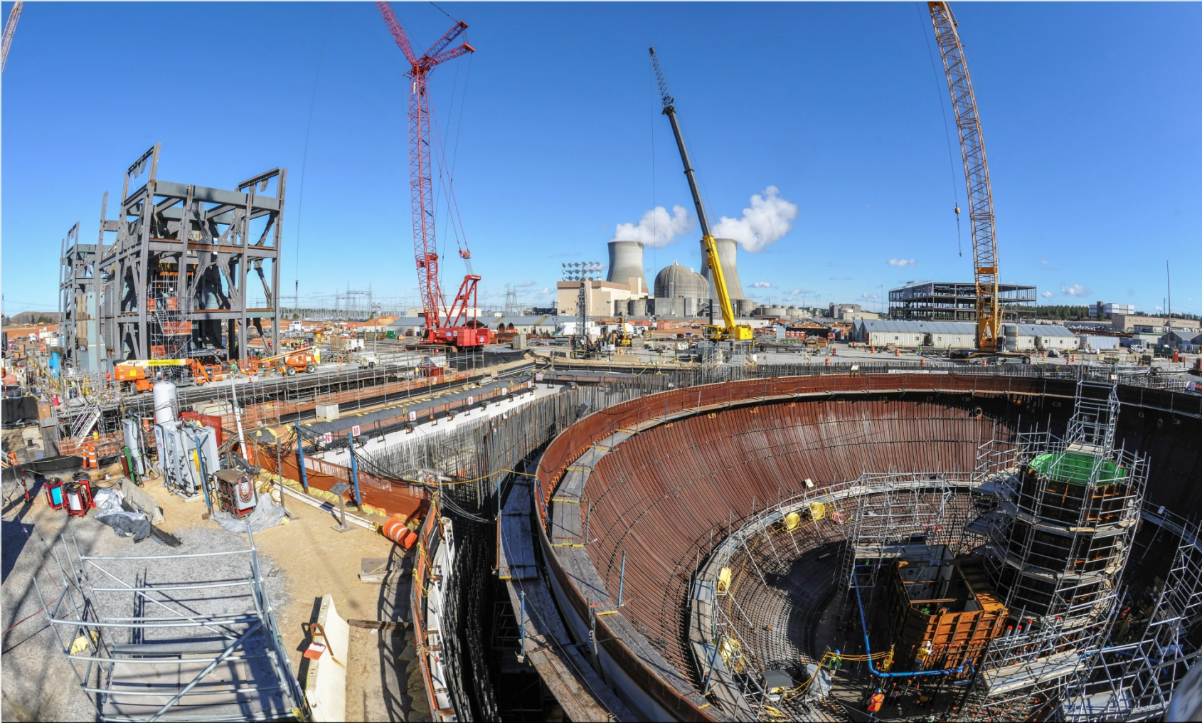
Construction of Vogtle Unit 3 nuclear island on right, with Unit 3 turbine building on left