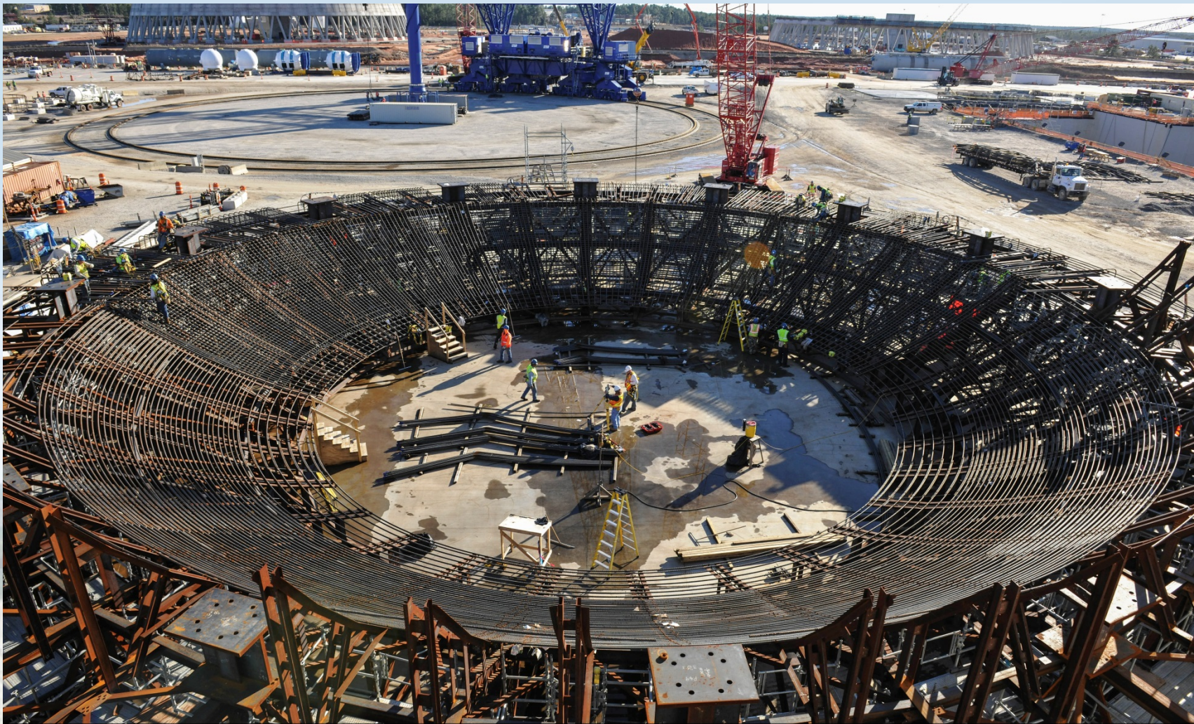
Construction of Vogtle Unit 4 CR-10 cradle