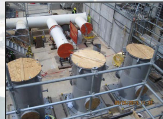
Condensate pumps (3)