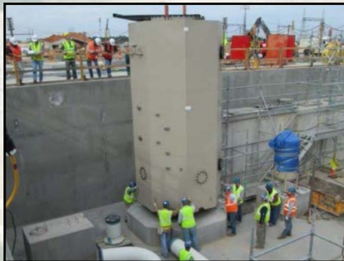
Auxiliary Boiler & Flash Tank