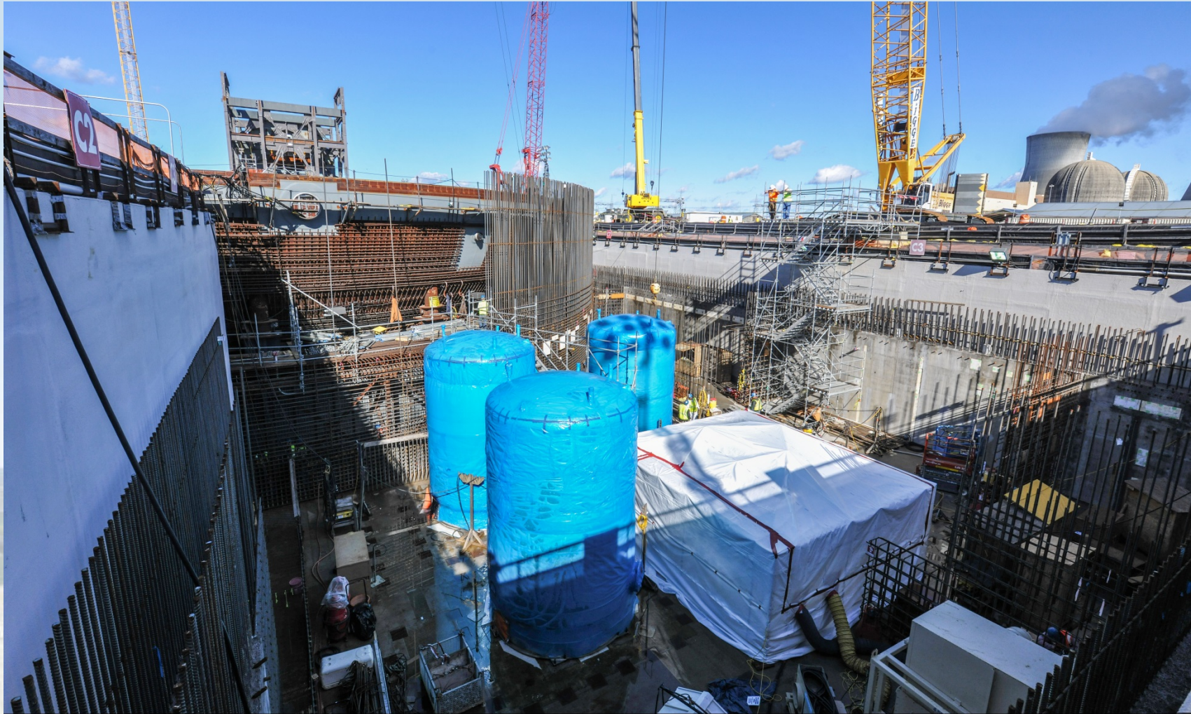
Vogtle Unit 3 nuclear island