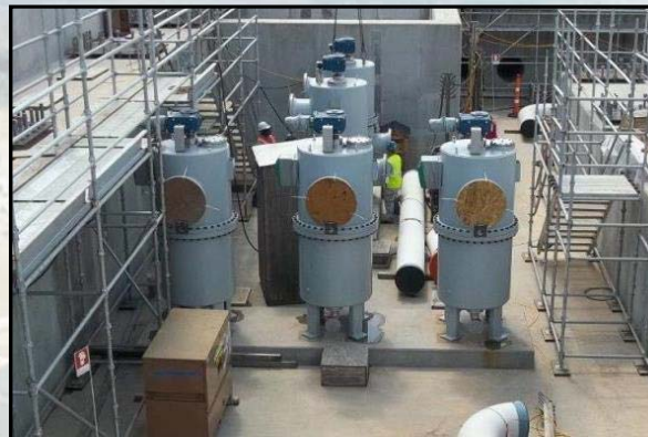
Backwash Strainers (5)