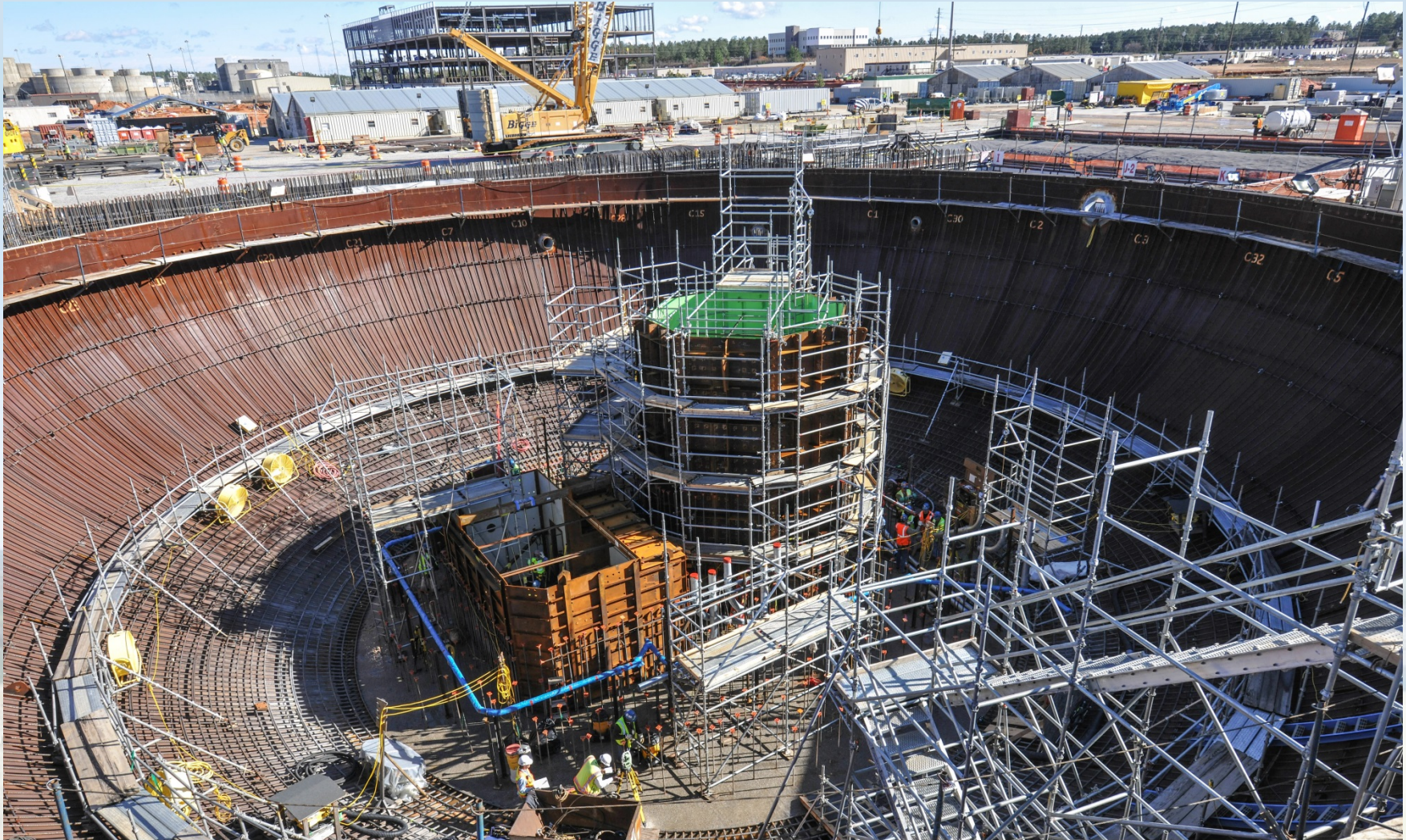
CA-04 module inside the Vogtle Unit 3 containment vessel bottom head