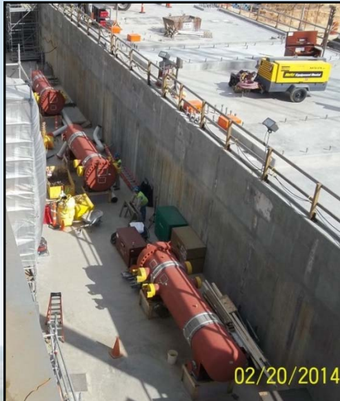
Condensate Drain Coolers (3)