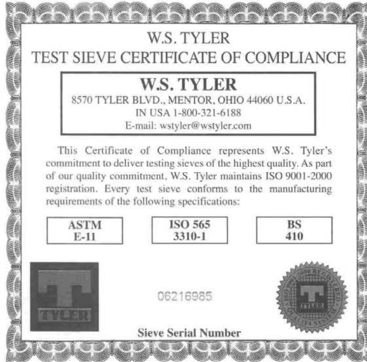
Table 21. Sieve Certificate of Compliance for the #270 Sieve (Top) and #400 Sieve (Bottom).